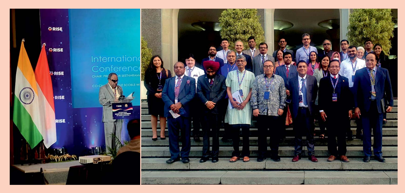
Prof. K. Seetharama Rao, VC, BRAOU attended International Round table Conference at Yogyakarta in Indonesia from10th and 11th March, 2023 on "Opportunities for Collaboration between India and Indonesia in the Education sector with special reference to Industry Academia partnership"