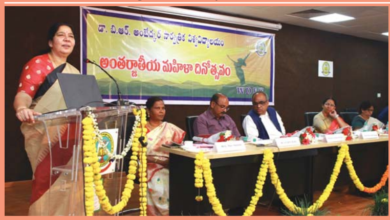
Smt. Satyavathi Rathod, Hon'ble Minister for ST Welfare, Women and Child Welfare, Government of Telangana addressing on International Womens Day