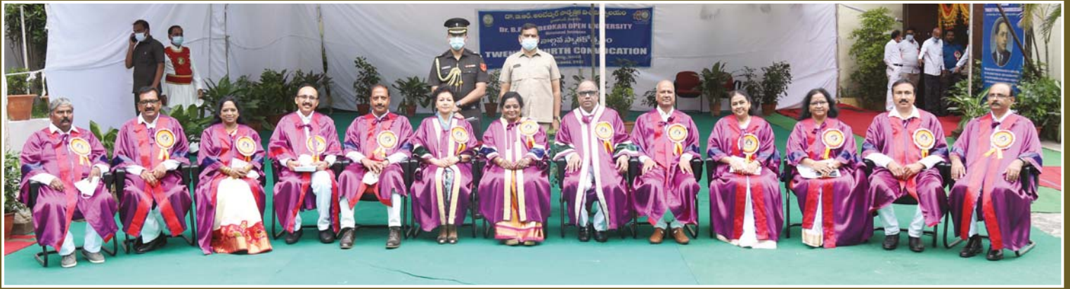
BRAOU 24th Convocation Grace Committee