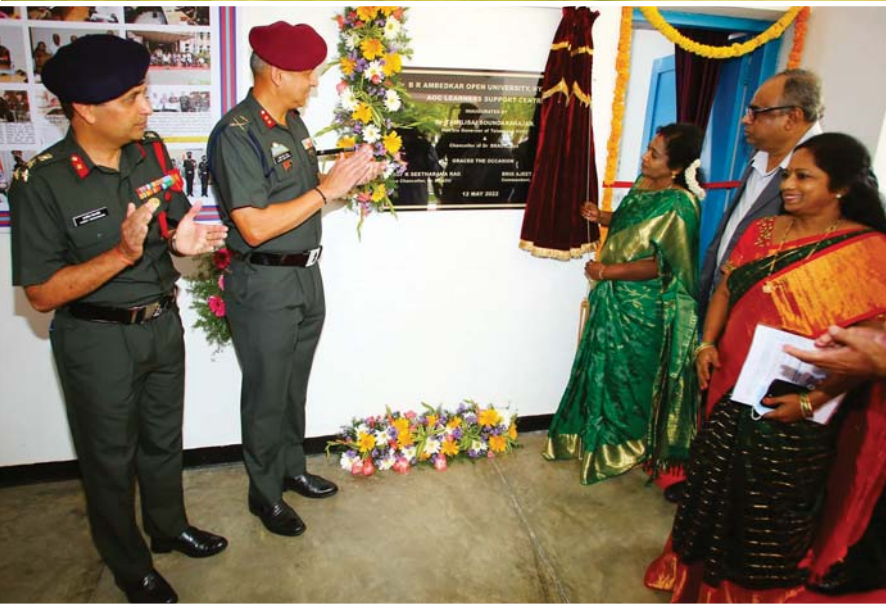
Dr. (Smt.) Tamilsai Soundararajan, Hon'ble Governor of Telangana and Lt. Governor of Puduchery inaugurating Learner Support Center at AOC Center, Secunderabad

Quarterly News Bulletin of Dr. B.R. Ambedkar Open University, Hyderabad.