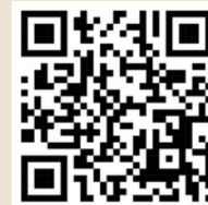
Location QR Code