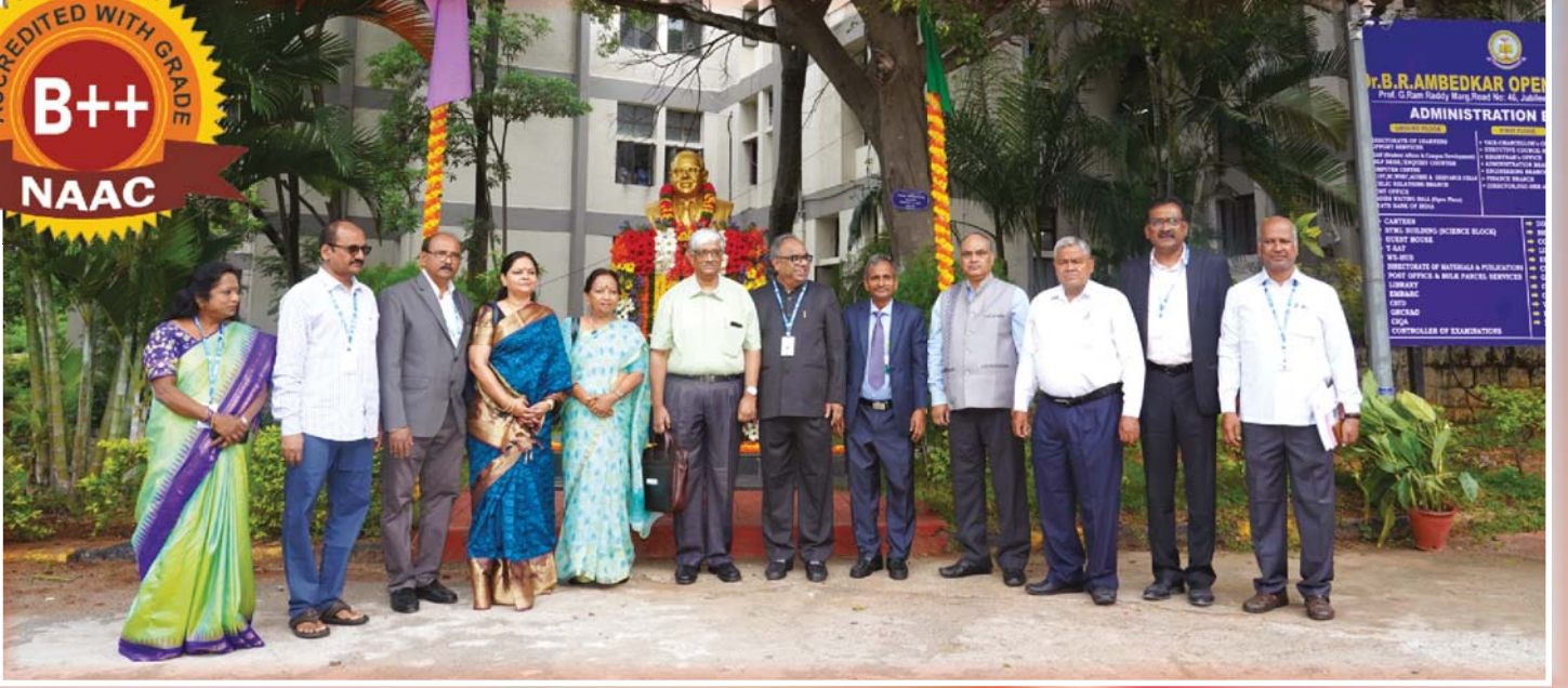
NAAC PEER Team visited BRAOU on July 24, 2023