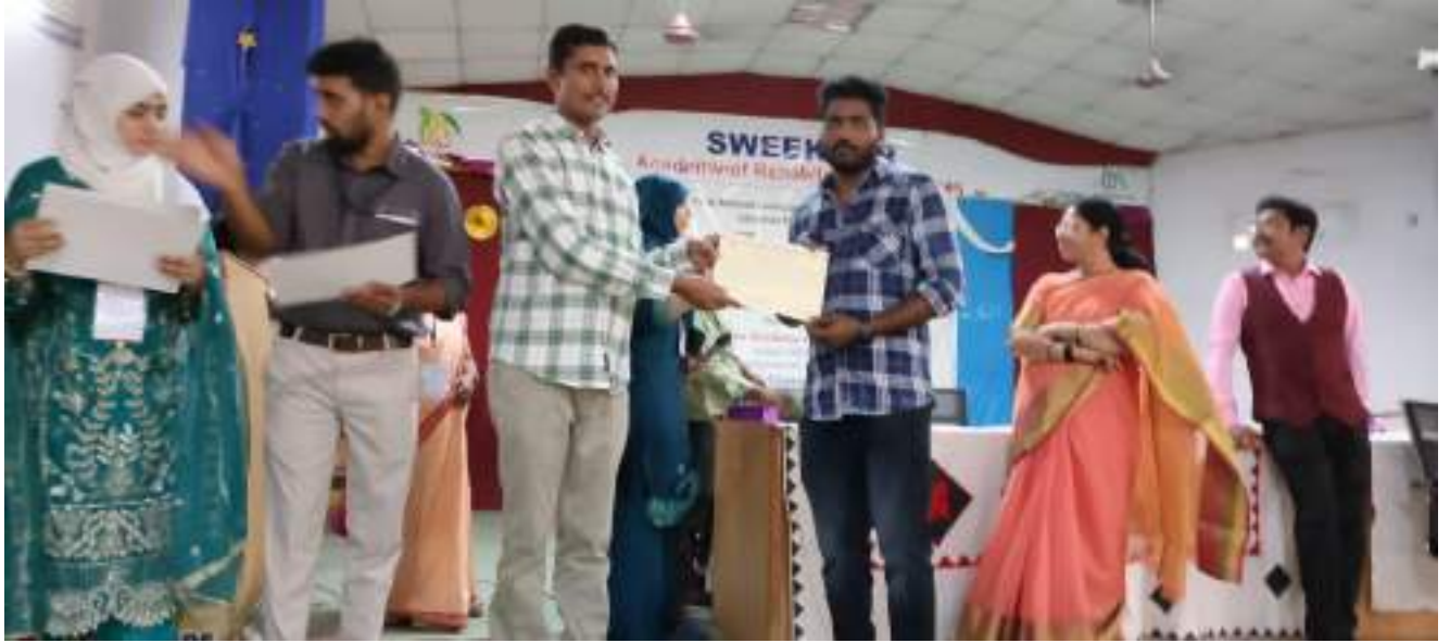
Participants Receiving Certificates