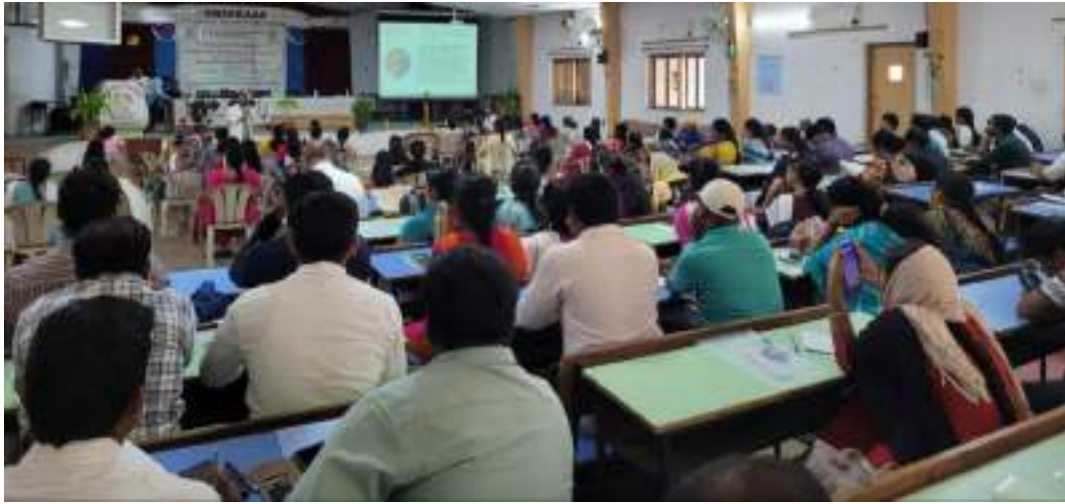
Photographs of the CRE Programme on 3 days National Level CRE Programme on “Strategies and Management of Children with Autism Spectrum Disorders” Dates: 07th to 09th March 2025