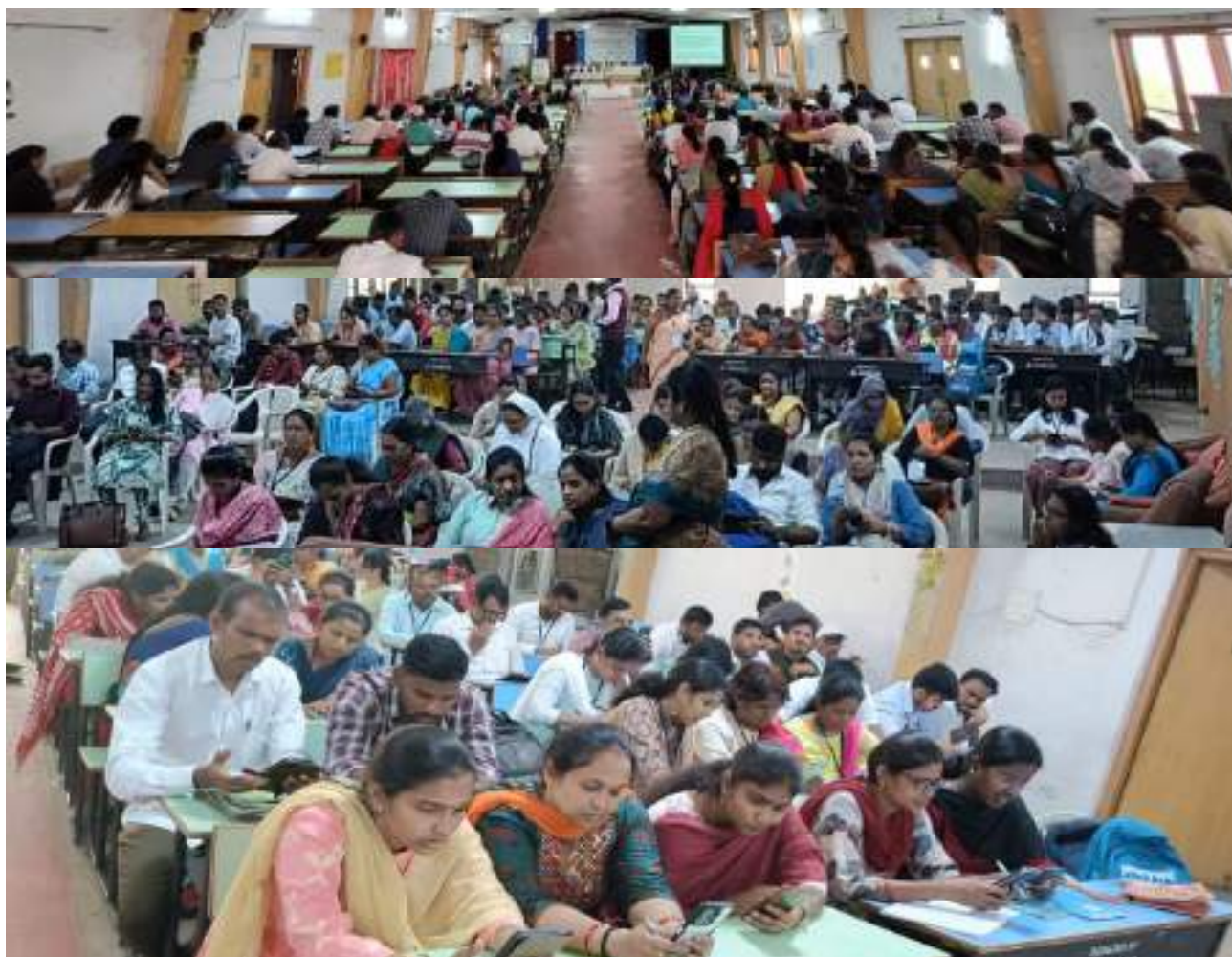
Participants are attempting Test by using their mobile phones