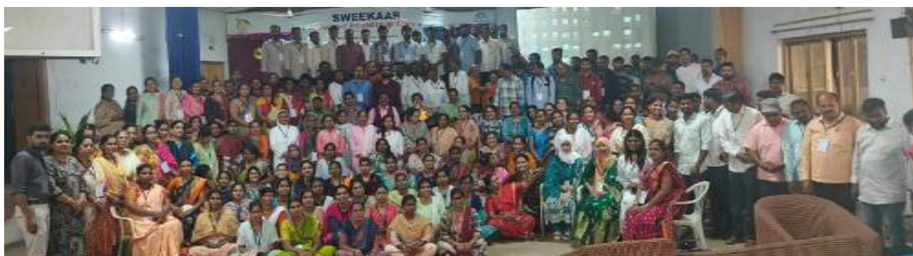
Group Photo of participants and resource person