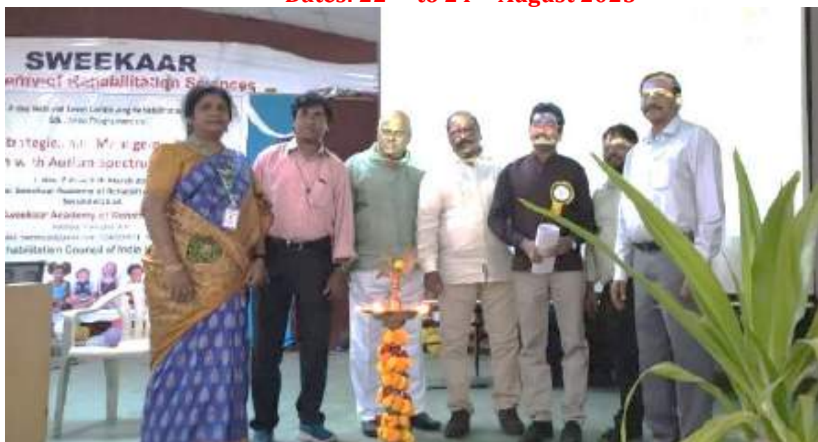
The Guests of the inaugural Session of CRE on “Comprehensive Understanding and Inclusive Practices for Children with Learning Disabilities”.