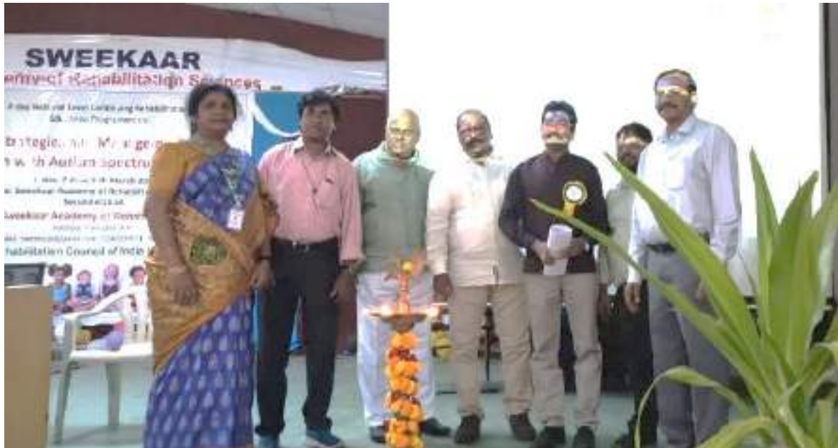
The Guests of the inaugural Session of CRE on “Strategies and Management of Children with Autism Spectrum Disorders”.